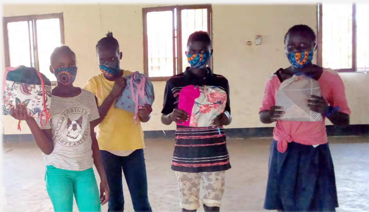
Menstrual Hygiene Education and Dignity Kits for Living Water Orphanage