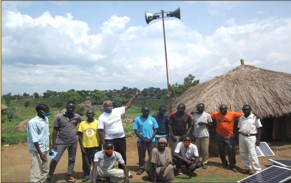
Public address systems in refugee settlements broadcast messages of hope.

ACROSS Media consists of digital audio recordings, print publications, mobile projector ministry, shortwave radio, and teacher training programmes. The printing facility is located at our base in Arua, Uganda and the digital recordings take place in both Arua and Juba.